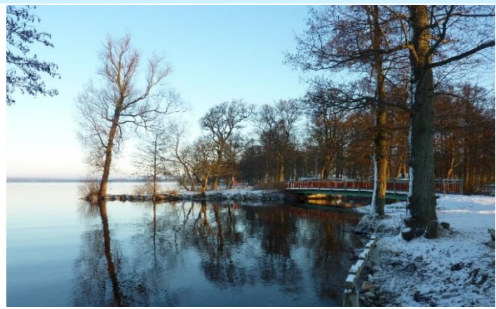
Figure 1. Inlet into Lake Ringsjön with the highest nutrient inflow, Hörby 2015.

The Rönne å catchment is located in Southern Sweden. It includes lakes (e.g. Ringsjön) and rivers (Rönne å) that drain into the Kattegatt sea. Intensive agricultural activities in the past resulted in high levels of eutrophication of the Rönne å water bodies. Today, the landscape is perceived as multi-functional with high recreational values. Lake Ringsjön, for instance, is a major tourist and recreational destination. The turbid lake and its toxic algae blooms thus became a major target of restoration activities by local municipalities.